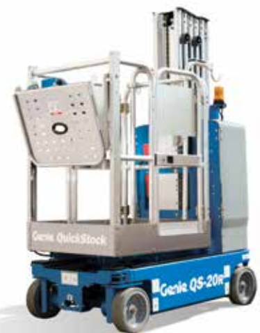
* Warehouse models only ** Not available with inverter